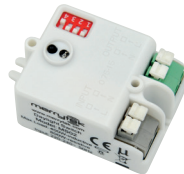
Daylight Switch Page 215