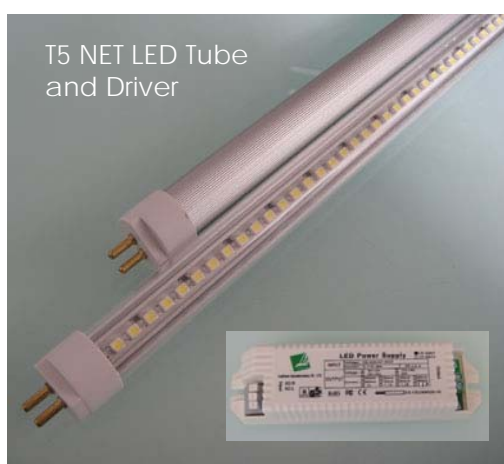
T5 NET LED Tube and Driver